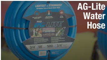
AG-lite Water Hose September 19, 2017 3:42