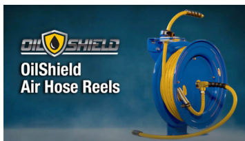
OilShield Air Hose Reels